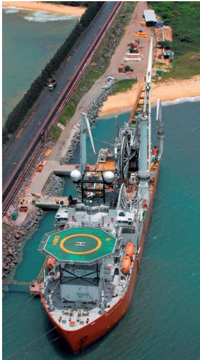
Seven Oceans at Ubu spoolbase, Brazil

The offshore pipelines and equipment installation campaign will take place between Q3 2010 and Q2 2011 and will be undertaken using the Seven Oceans and supported by the Seisranger for survey and light construction work.