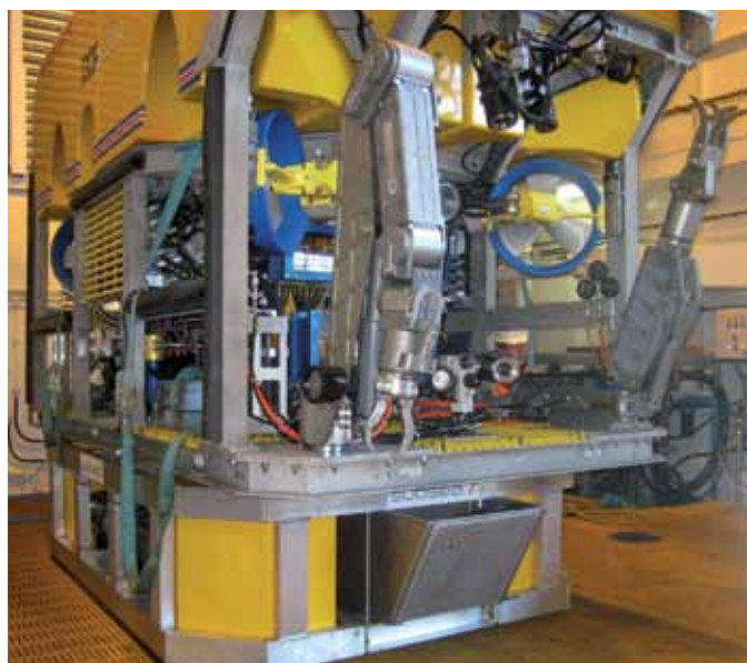
Subsea 7 Tree on Wire Skid interfaced to the installation vessel Workclass ROV

Skandi Seven complete with Shell USC Remotely Operated Vehicle Support Vessel spread, 250te offshore crane and dedicated tooling skids for functioning tree connectors and leak testing the connections.