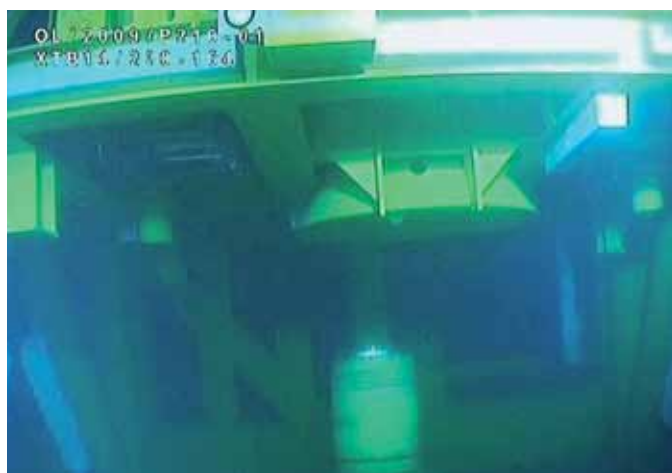
Xmas Tree correctly orientated and moving towards the empty Wellbay