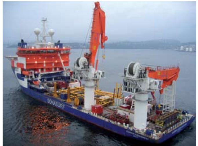
Bourbon Oceanteam 101

The project is further supported from Subsea 7's global operations with a wide range of additional services such as remote technology engineering, design engineering and technical Centres of Excellence.