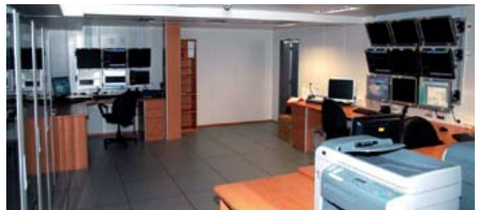
Bourbon Oceanteam 101 Survey Suite