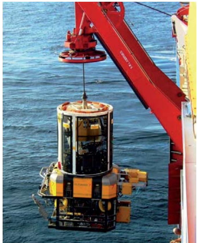
ROV launch from Bourbon Oceanteam 101