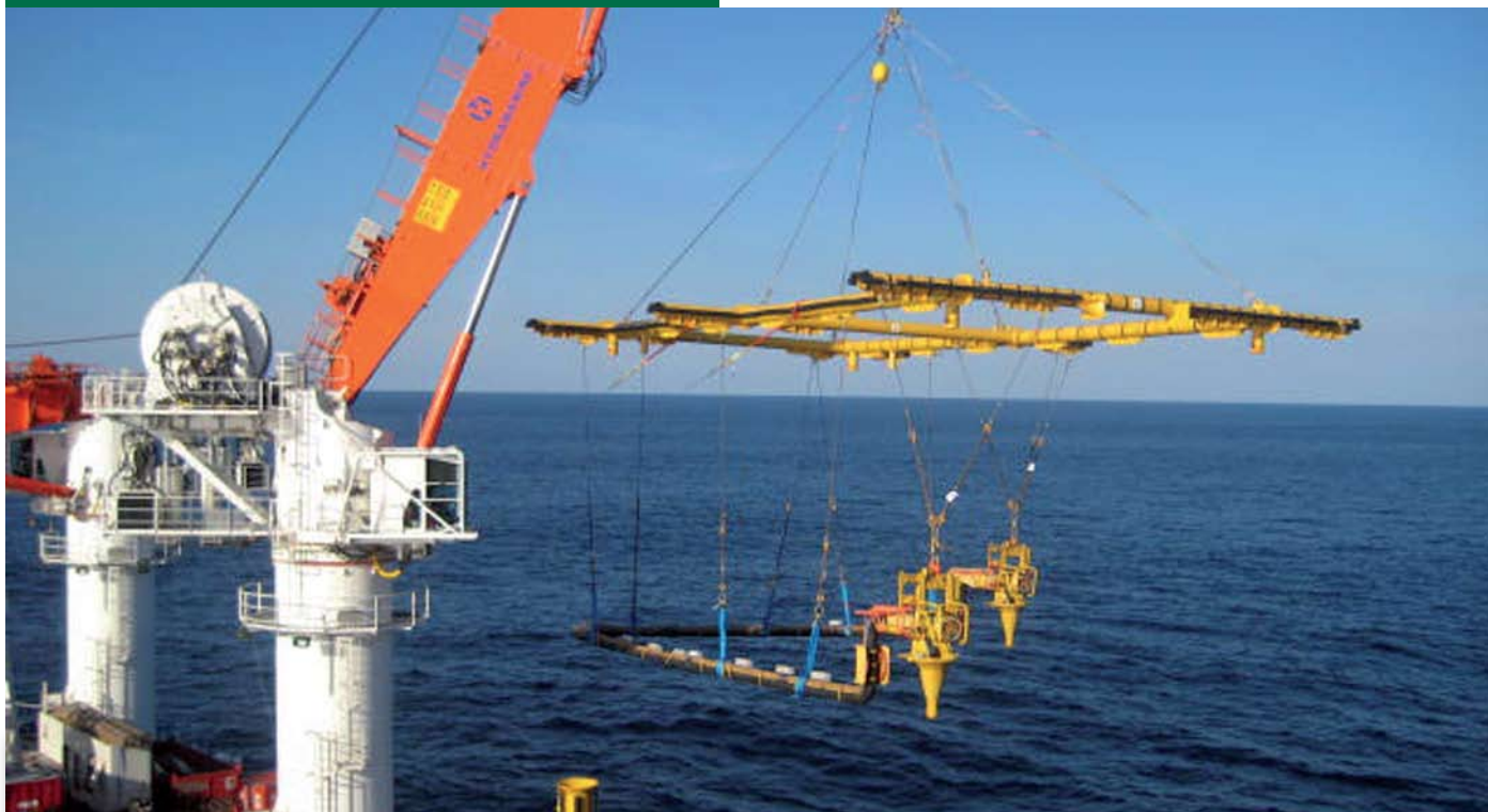
Overboarding of rigid production jumper

Underwater services contract for a variety of subsea services from inspection, repair and maintenance, through light construction and intervention for BP's deepwater developments in Block 18, offshore Angola.